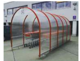
Supermarket trolley shelters